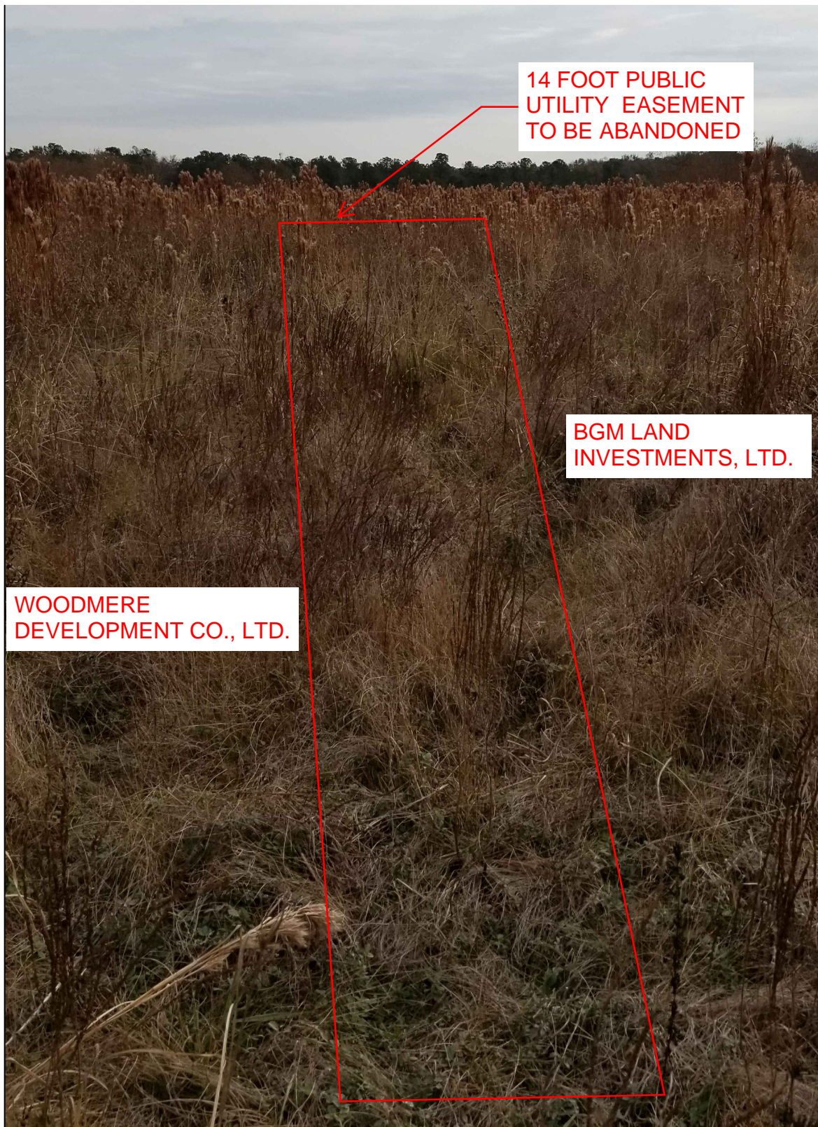
SOUTH PLAT BOUNDARY IN RESERVE "C" LOOKING NORTH