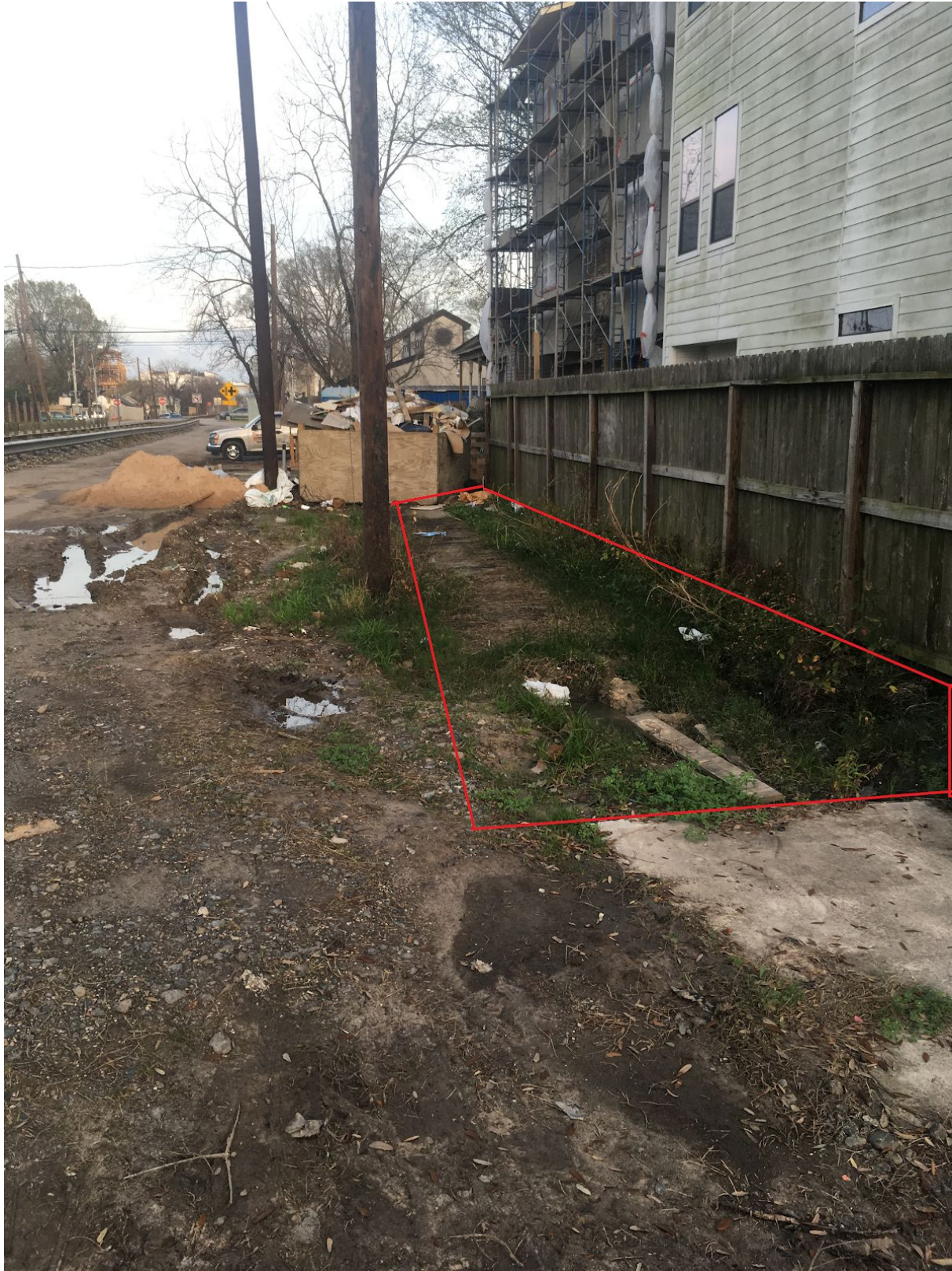
Red: Requested abandonment area to be annexed into 1514 Johnson Steet's property