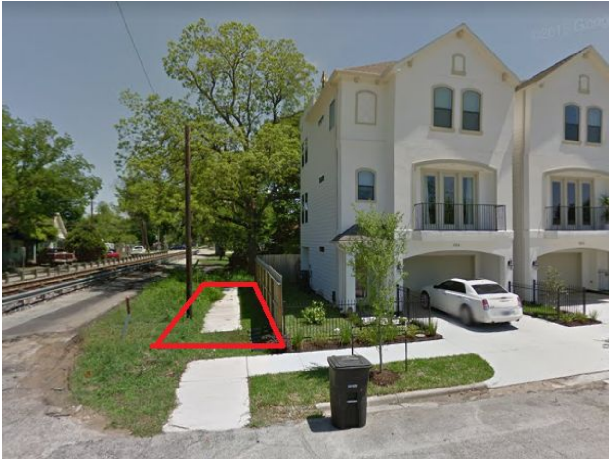
Red: Requested abandonment area to be annexed into 1514 Johnson Steet's property