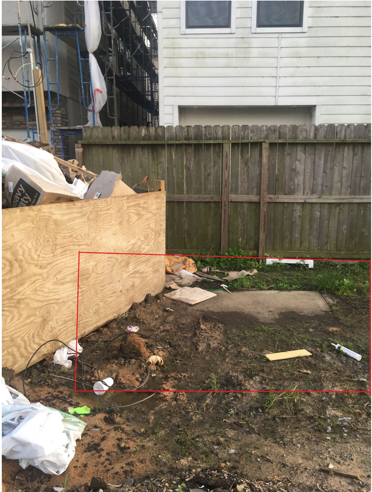
Red: Requested abandonment area to be annexed into 1514 Johnson Steet's property