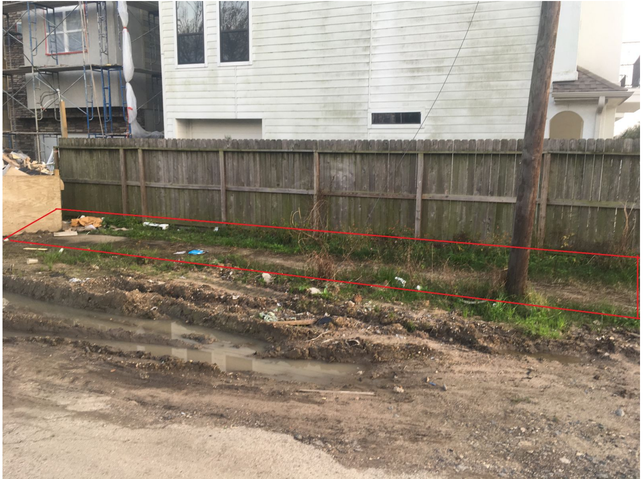
Red: Requested abandonment area to be annexed into 1514 Johnson Steet's property